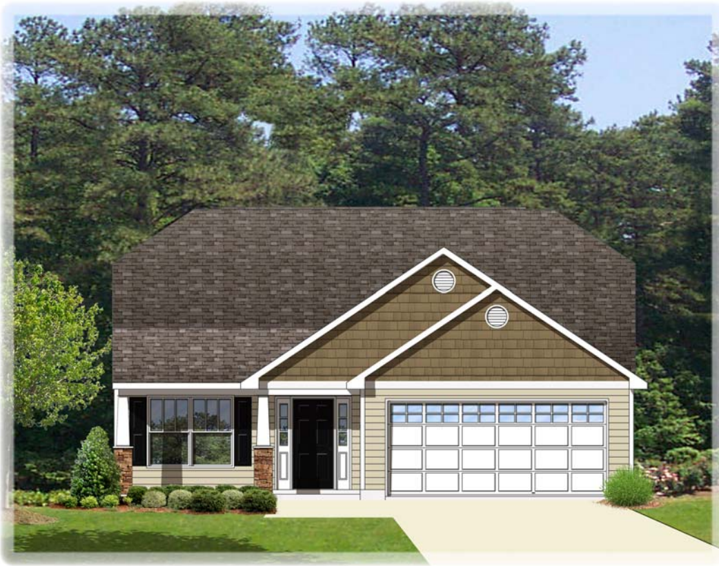
ELEVATION 6 (W/OPT. SIDELIGHTS & COUNTRY PORCH)