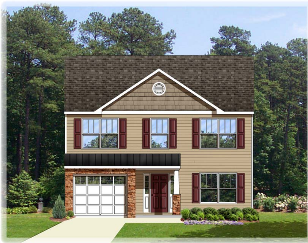
ELEVATION 5 (WITH OPT. SIDELIGHTS, STONE, METAL ROOF)